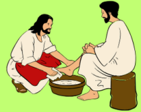
Jesus washes the disciples' feet