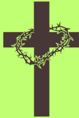
The symbol of Hope