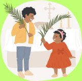
The story of Palm Sunday

Travel around stations in the church, reflecting on Easter stories through multi-sensory, family friendly, activities