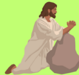
The Garden of Gethsemane