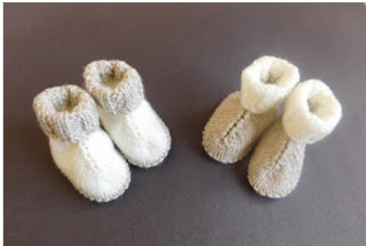
Baby Hug Boots